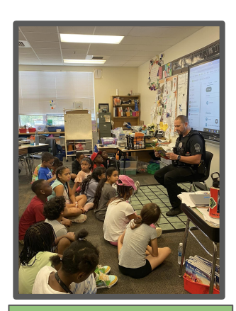
Easter Eggstravaganza March 28th 6-8 Academic Spring Themed Tasks and Games